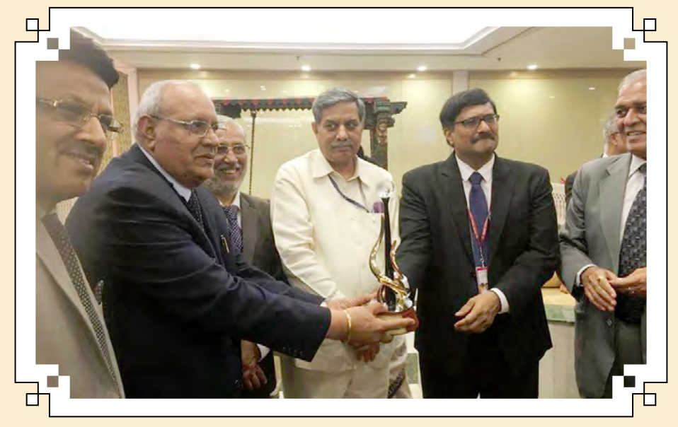
MHRD India Ranking 2019 Award Ceremony

ASLI Conference-2019 National University of Singapore